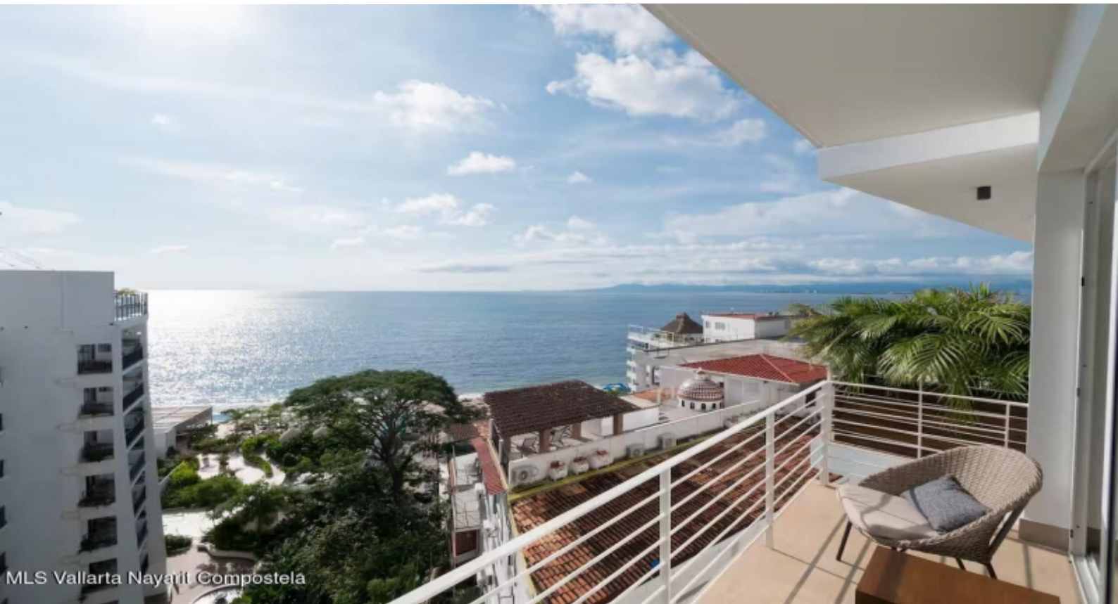
MLS Vallarta Nayali Compostela