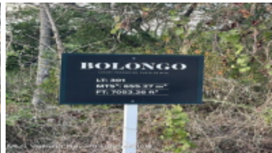
MI S Vallarta Nayarit Compostela

ESPAÑOL ABAJO Discover a reserved lot to build your dream home in an exclusive private community on the north coast of the bay. Enjoy amenities like a private beach, beach clubs, restaurants, pools, gym, cafe, cinema, spa, sauna, kids' club, and a minimarket. Conveniently located near Punta de Mita's stunning beaches, this is a unique opportunity to create your perfect beachfront retreat. Lot 301 is very private and tranquil, located at the end of a cul-de-sac with only one bordering neighbor. Only a five minute walk, through the development's lush beau