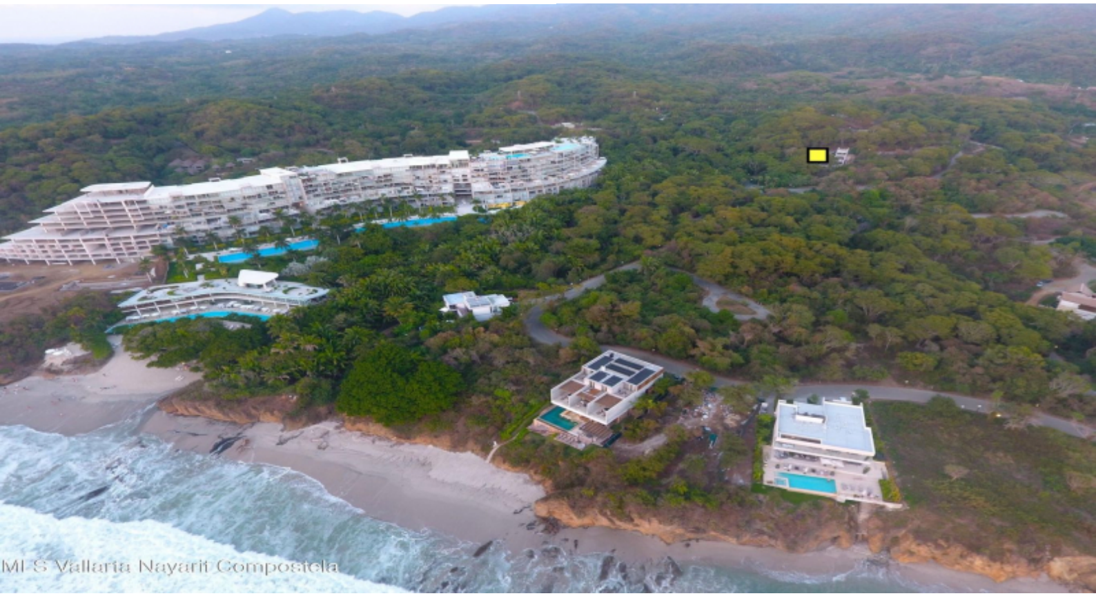
MI S Vallarta Nayarit Compostela