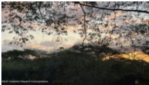
MI S Vallarta Nayarit Compostela