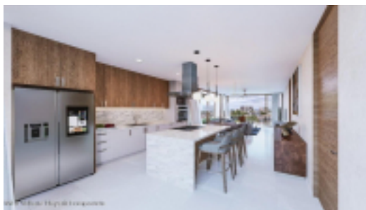
MLS Vallarta Nayarit Compostela