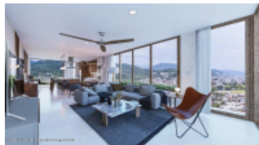
MLS Vallarta Nayarit Compostela

Affordable luxury awaits at La Perla, a boutique condo with a 95 Walkability score, great rental income potential, just steps from the beach, Malecon, and trendy Versailles neighborhood. Unit 302 offers 111 m 2 of living space w/2 bedrooms, 2 baths & beautiful ocean & mountain views. Shops, dining, and entertainment nearby; Romantic & Hotel Zones a short drive. Watch the sunset over the ocean from the rooftop infinity pool while BBQing. Includes deeded parking; underground garage ... español en observaciones del suplemento