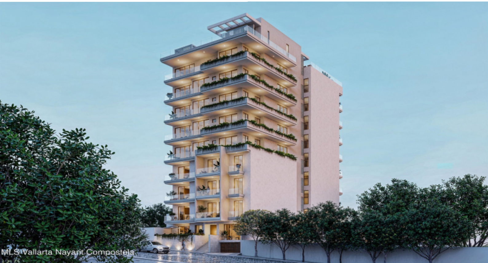
MLS Vallarta Nayarit Compostela