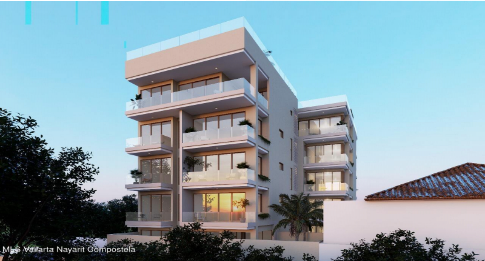
M/S Vallarta Nayarit Compostela