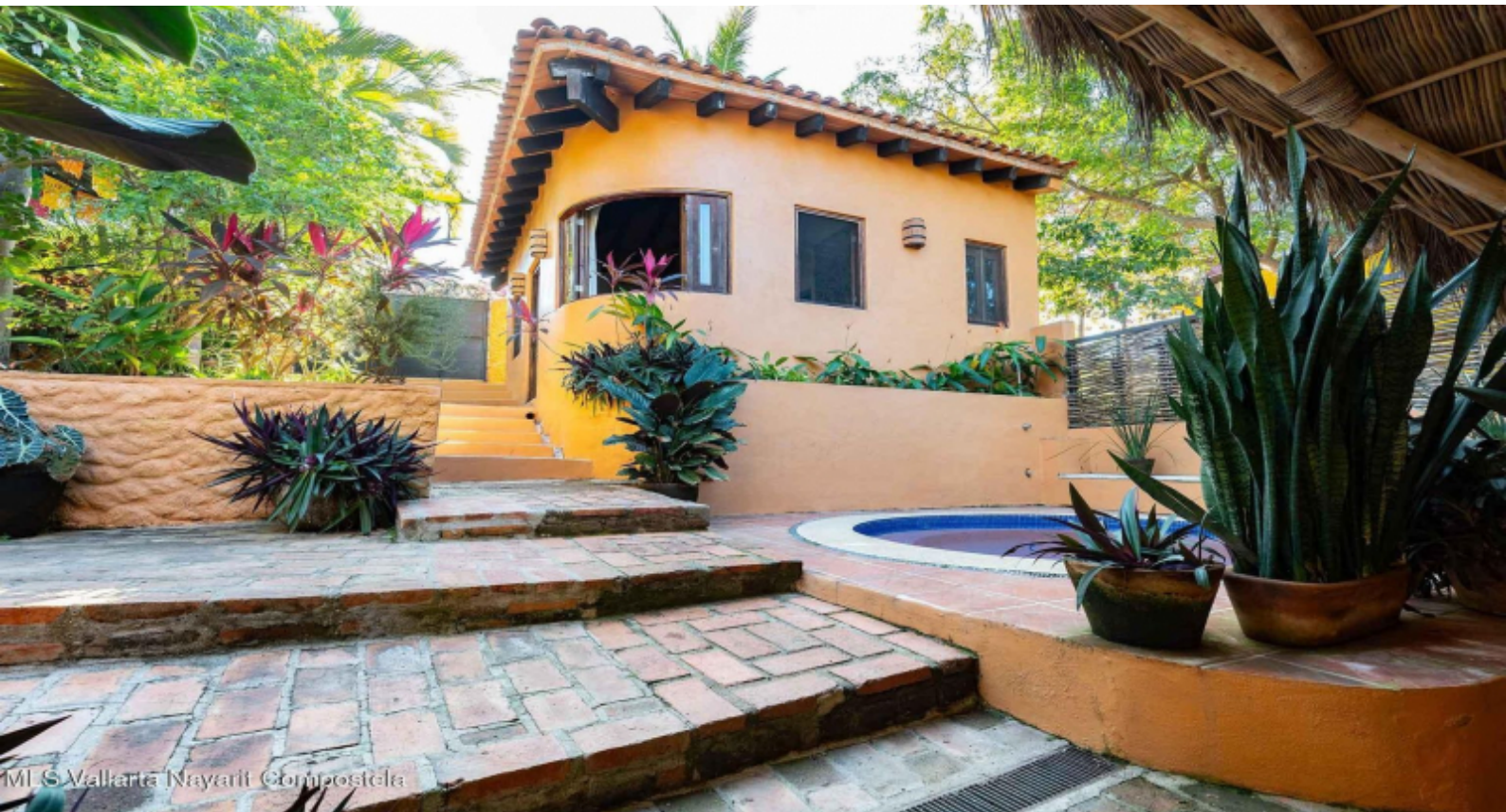
MI S Vallarta Nayarit Compostela