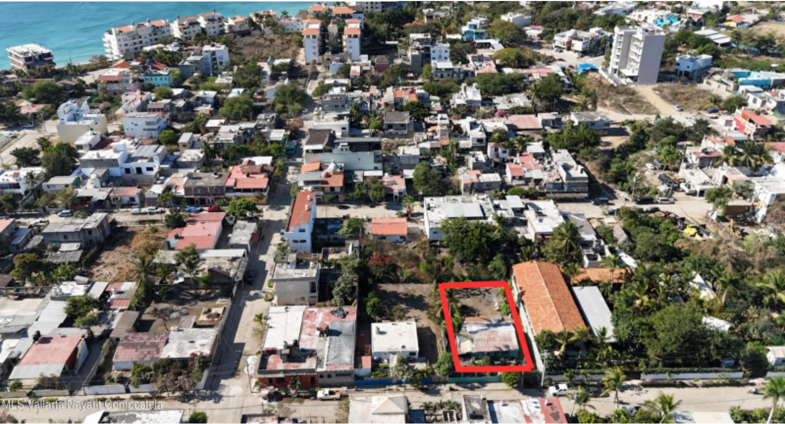
M/S Vallarta Nayarit Compostela