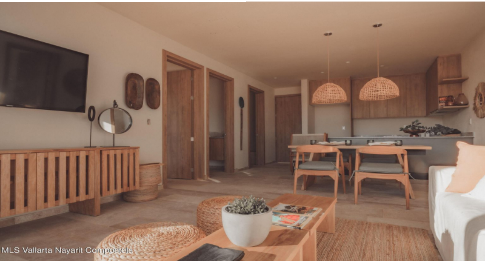
MLS Vallarta Nayarit Compositela