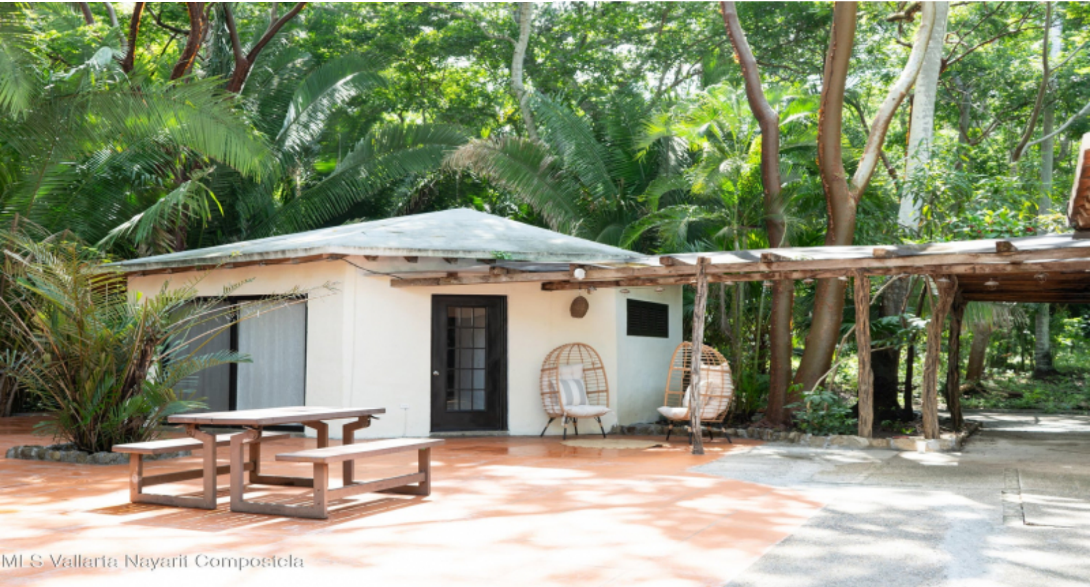
Mi S Vallarta Nayarit Compostela