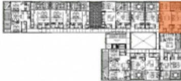
GRACIA 2B 2 BED, 2 WC UNIDAD 204C