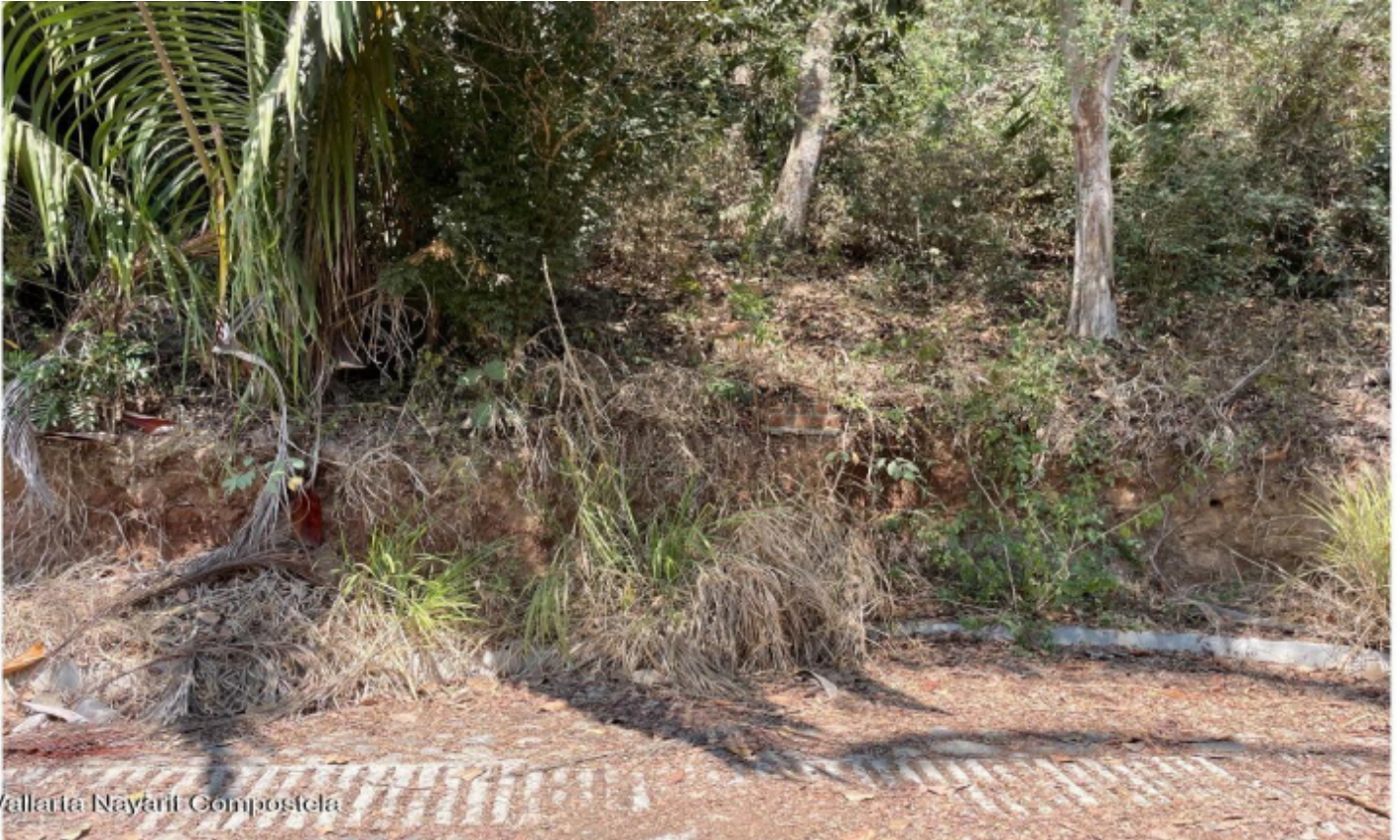
MIS Vallarta Nayarit Compostela